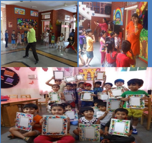
Learning is fun