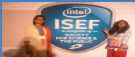
The International Science and Engineering Fair (ISEF) in Pittsburgh.