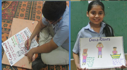
Session on Child Right