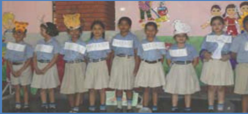
Students showcasing their acting skills