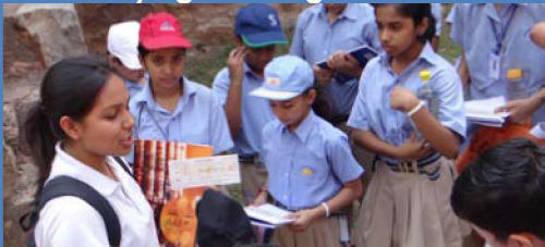
At the 'Garden of Five Senses'