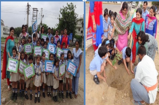
Tiny tots with green fingers