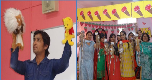
Art of Puppetry