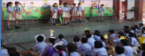
Enacting a fable