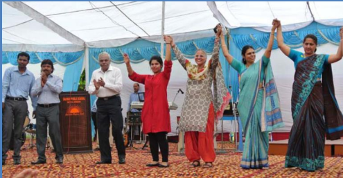
Human chain formed by the staff