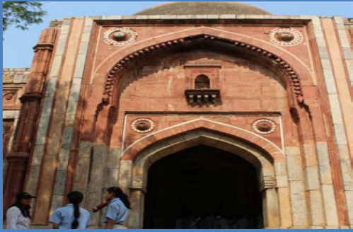
A glimpse to our past