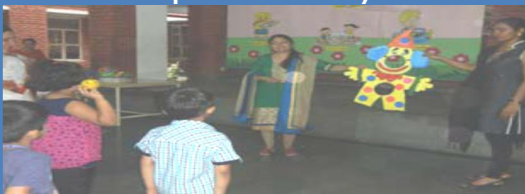
Playing 'Feeding the Clown'