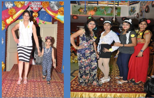
Mothers in Retro Style

The mother is a child's best friend. She is the true spirit and influence towards success. There is no replacement of a mother since she holds her child's hand for a while, but their hearts forever. In order to honour and salute all the wonderful mothers, a fashion show was organised on the Mother's Day on May 8, 2015. The mothers came beautifully dressed up in retro style of 70's and 80's. The 'Mom and Me' ramp walk was the real stealer of the day as the mother's zealous and wholehearted participation left the audience mesmerized.