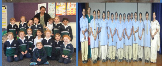
Exploring new boundaries