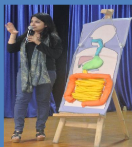
Session on 'SHE'