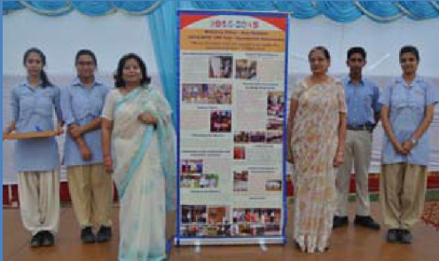
Unveiling of the History Panel