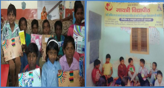
Let's learn together