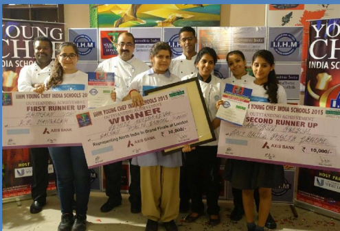
All the best!!!!!!