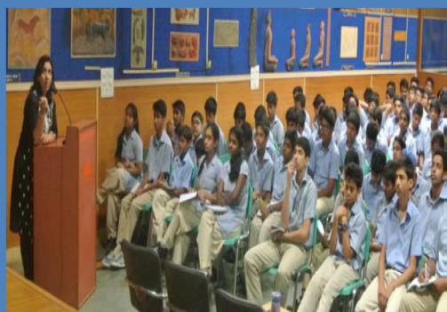
Session on Hepatitis