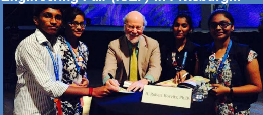
Interaction with H. Robert Horvitz, Nobel Prize winner