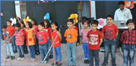
Orchestra presentation by students