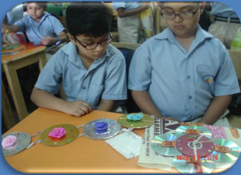
Creativity at its Best