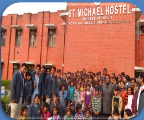
Service to Humanity