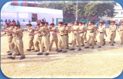
Marching Ahead...NCC Cadets