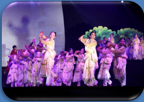
Buddha- A Dance Drama