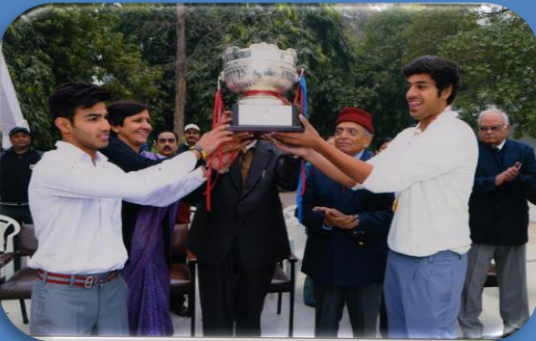
Coca Cola championship