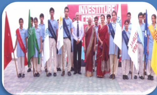
The Prefectorial Board