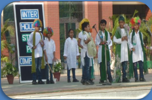
Spreading Awareness...Street Play