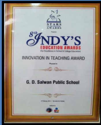
Honour to the School