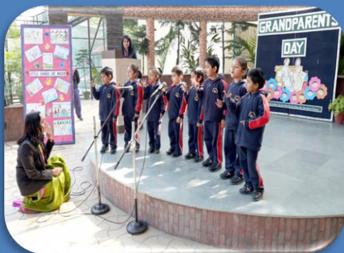
Gratitude towards Grandparents