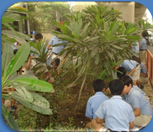
Nurturing the present for a brighter future

Green School Award: The school was awarded the Gobar Times Green Schools Award in the academic session 2012-13 by the Centre for Science and Environment (CSE), New Delhi for taking the initiative to create awareness, instilling respect and appreciation for environment in the students.