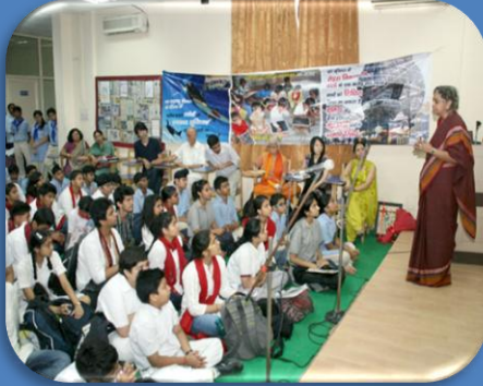
Let's give Peace a Chance