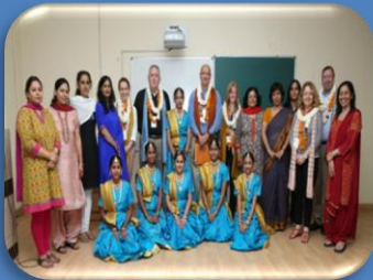
The delegation at school