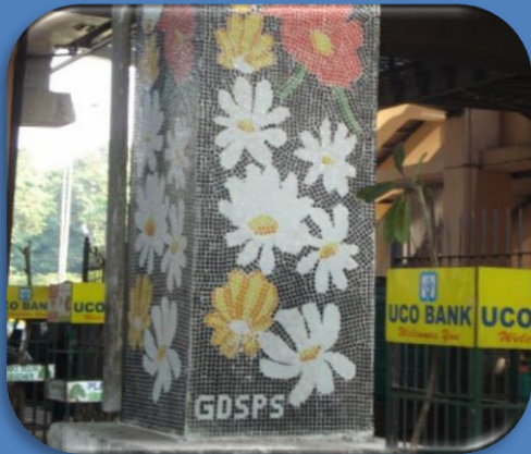
School Eco-Brigade in action