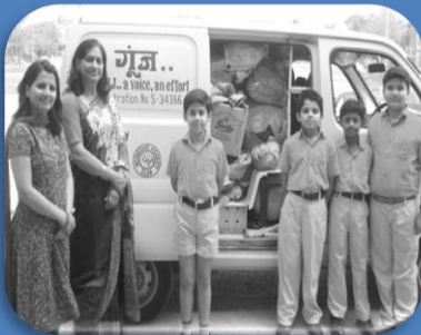
Goonj... lending a helping hand