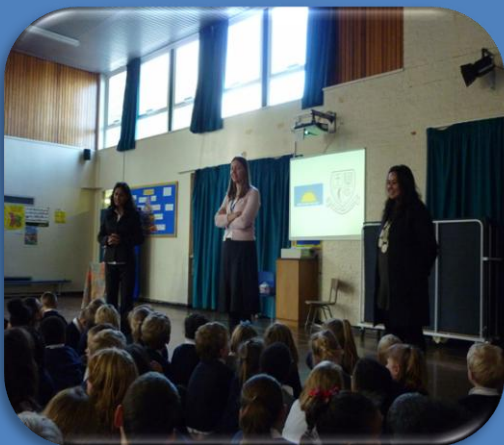
Sounds of India in UK