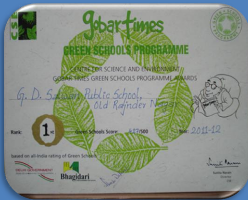
Green School Award