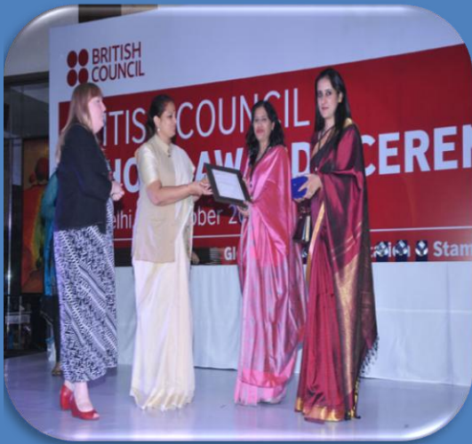
International School Award