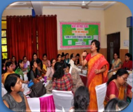
CBSE ASL Workshop