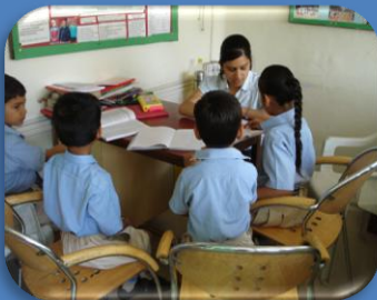
Session with Special Educator