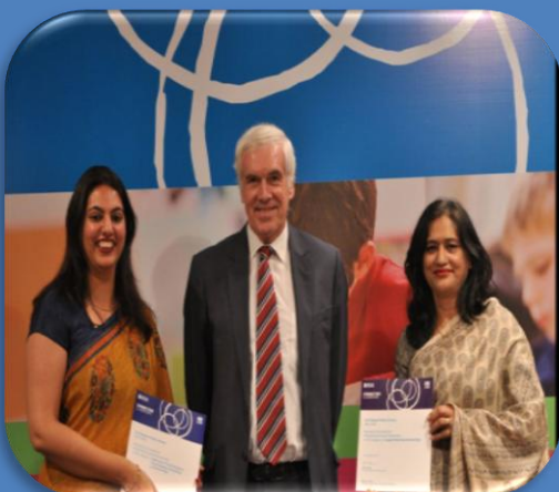
GSP Honours Award

G D Salwan Public School is a proud recipient of International School Award 2011-14 for its continued journey of collaborative learning programmes with eight partner schools in United Kingdom, Croatia, Sweden and USA. The students studied about World Culture, Architecture, Cuisine, Economy and Music and exchanged their projects and ideas with participating schools through email exchanges, blogs, British Council website and Videoconferencing sessions.