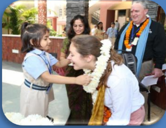
A traditional welcome