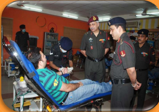
Blood Donation-The Greatest Gift of life