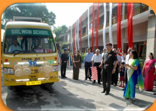
Flagging off the bus going to hospital with gifts