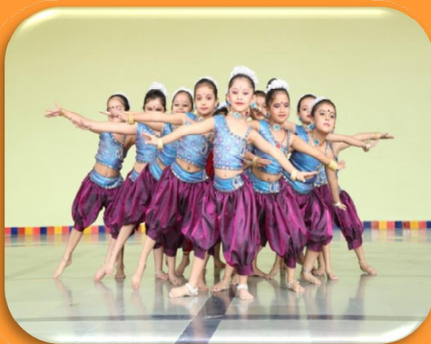
Little Salwanians enchant the esteemed audience with 'Ganesh Vandana'.