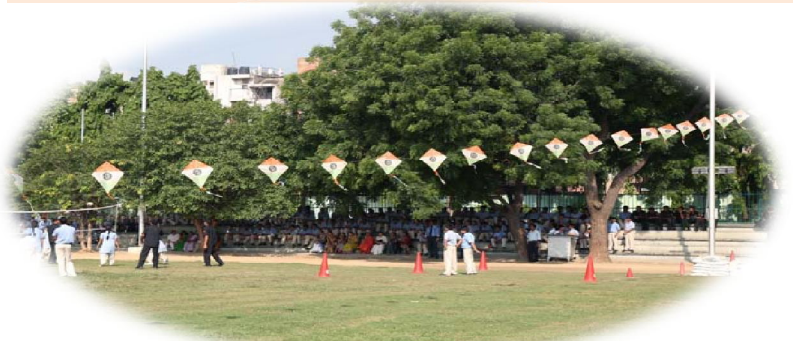
Colour of Patriotism

The students entertained the gathering through a cultural programme and Buddy Games between soldiers and parents. Kite flying added fun to the magnificent occasion. An amazing spectacle was witnessed by the guests, when an artist from Rampur decorated the sky with 100 kites on a single string.