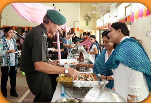
Food Festival -flavours of rich Indian cuisines.